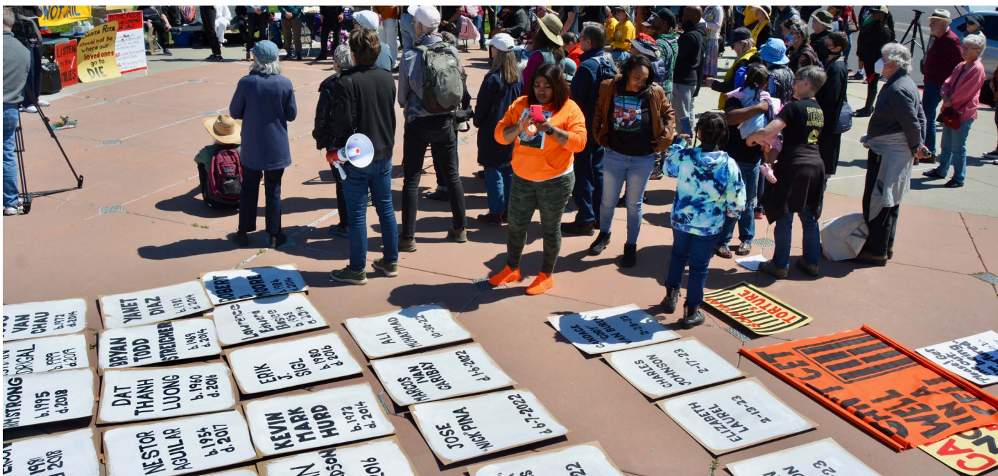
Rally participants contemplate names of Santa Rita detainees who died in the last 10 years.